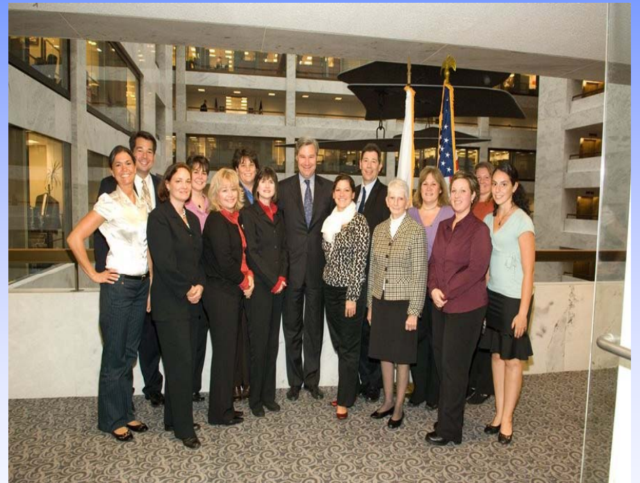
Photo: Johnson & Wales Graduate Students with Senator Whitehouse in the U.S. Senate Building