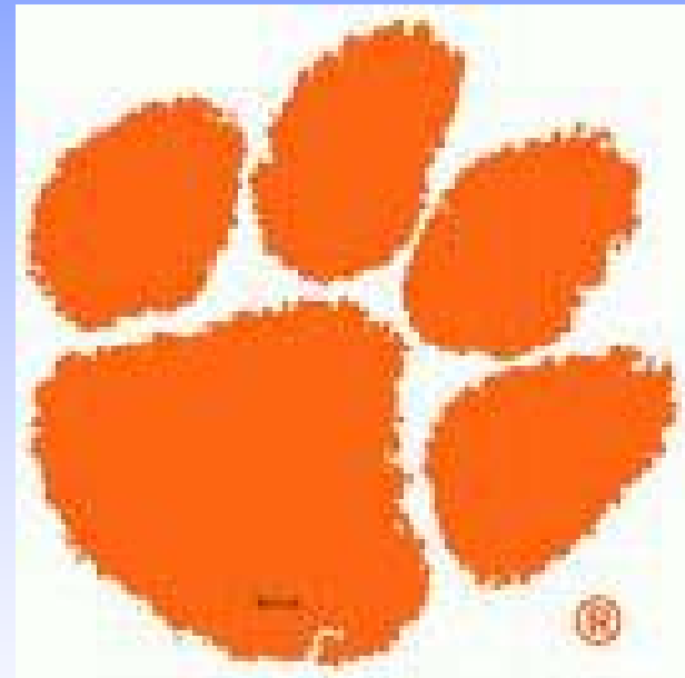
Photo: The Clemson University Fighting Tigers Logo