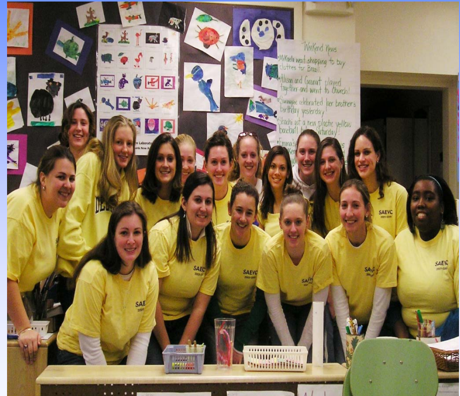
Pictured: EC Club of U. Delaware.