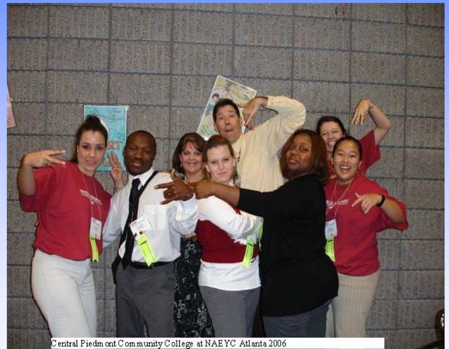
Photo: Central Piedmont Community College “Posse” Shot, NAEYC Atlanta