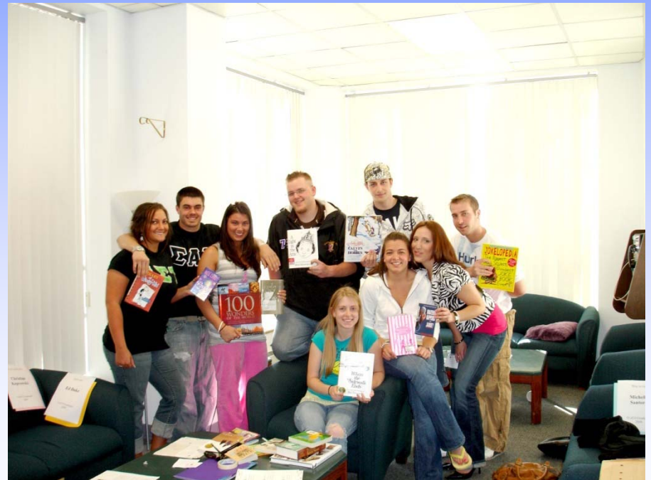
Students: NEA's Books Across America Initiative