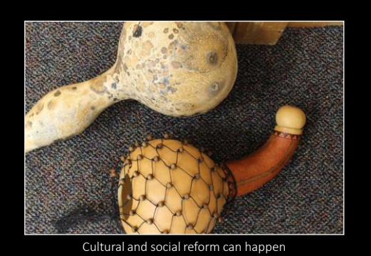
Cultural and social reform can happen in early childhood environments through the inclusion of musical instruments from around the world. © 2018