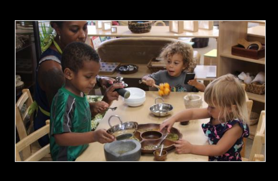
Loose parts promote democracy and collaboration.