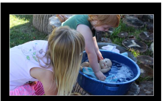
Loose parts supports children to develop and demonstrate empathy.