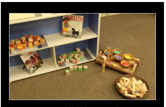
To support children's language, combine alphabet blocks in different languages with loose parts.