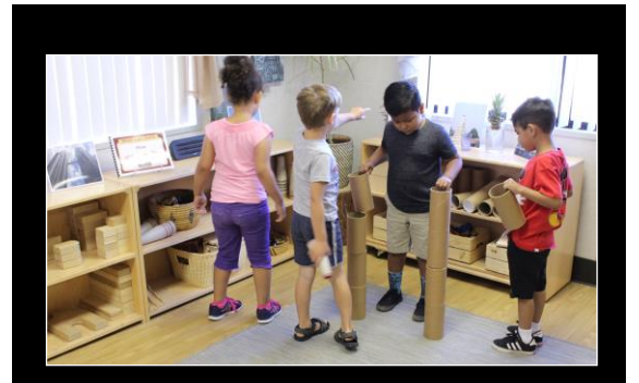
Loose parts increase the thinking possibilities for young children, as they gain power over their own capacities. © 2018