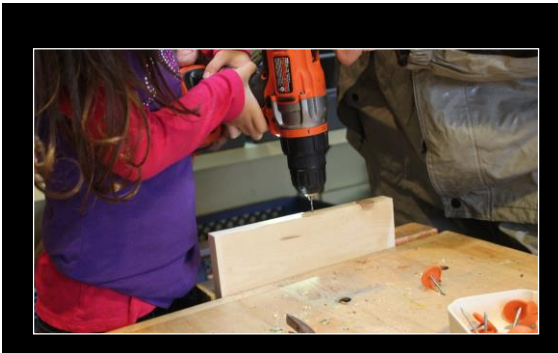
Loose parts help children gain an understanding of equality and equity.