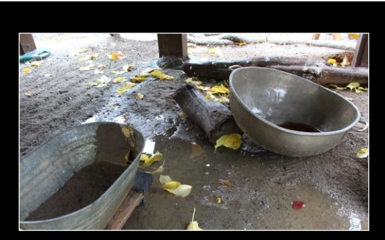
Loose parts are an educational philosophy, that transform early childhood environments, and provoke meaningful play experiences. © 2018