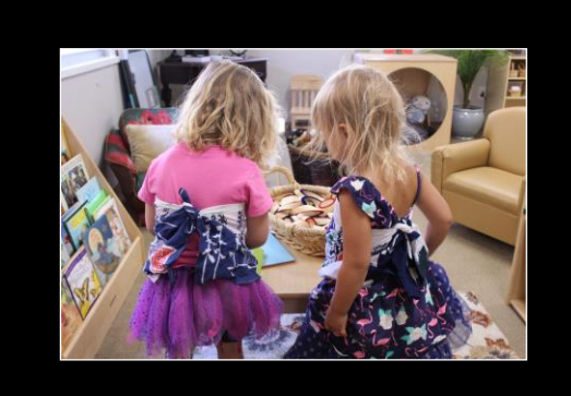
Loose parts support the development of imaginative play.