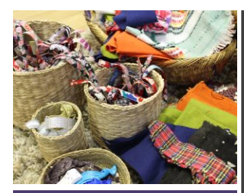
May you be inspired to use loose parts to create culturally sustainable environments.

Clay is sustainable and promotes deep sensory opportunities for young children.