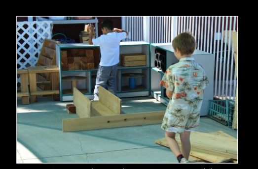
An environment that is rich in engineering possibilities can foster critical reflection, while giving children the opportunity to see a hopeful future.