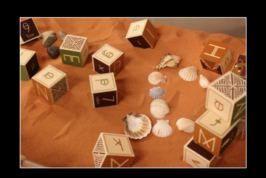
Providing alternative tactile options supports multiple differences and equity.