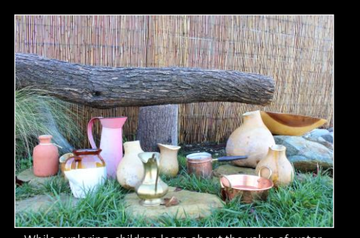
While exploring, children learn about the value of water, preserving it, and actively advocating for communities that may not have easy access to water. © 2018