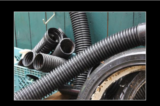
Intriguing materials beckon children's sense of curiosity, while participating in a sustainable environment.

Real objects allow children to compare similarities and differences, an important skill to understand different perspectives. © 2018