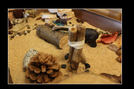
Small worlds invite children to use their imagination and learn about different habitats that exist in the world.