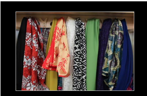
Authentic fabrics from around the world deepen children's understanding of diversity.