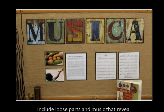
Include loose parts and music that reveal children's home language, culture, and traditions.