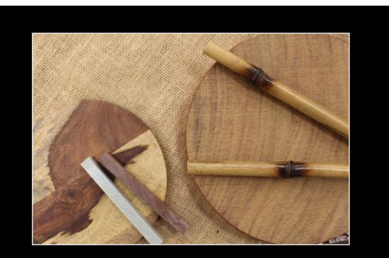
Music is an avenue for bringing children and adults together, as it resonates with our hearts and souls.