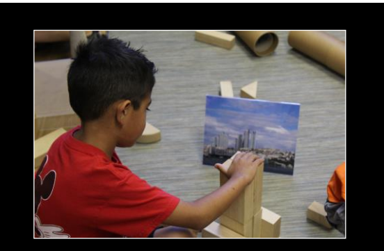
Loose parts explorations provide children with the opportunity to explore towers from around the world.